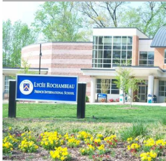
LYCÉE ROCHAMBEAU The French International School